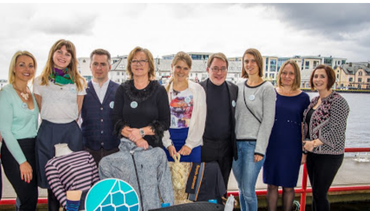
Meetings & Conferences