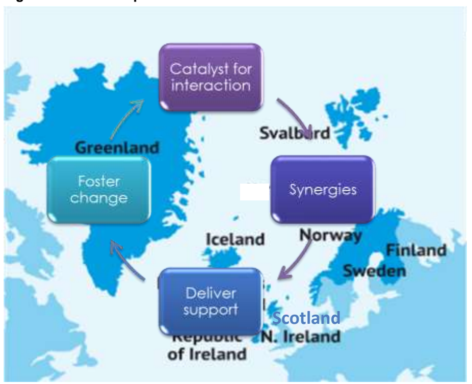
Figure 4: Arctic Cooperation