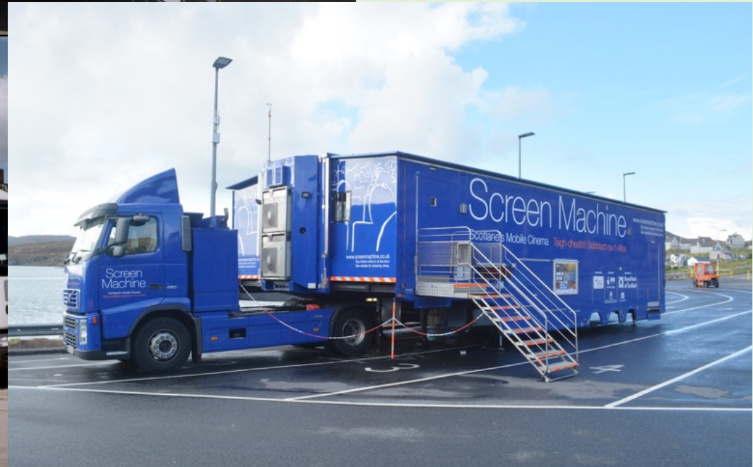
Screen Machine 2; today