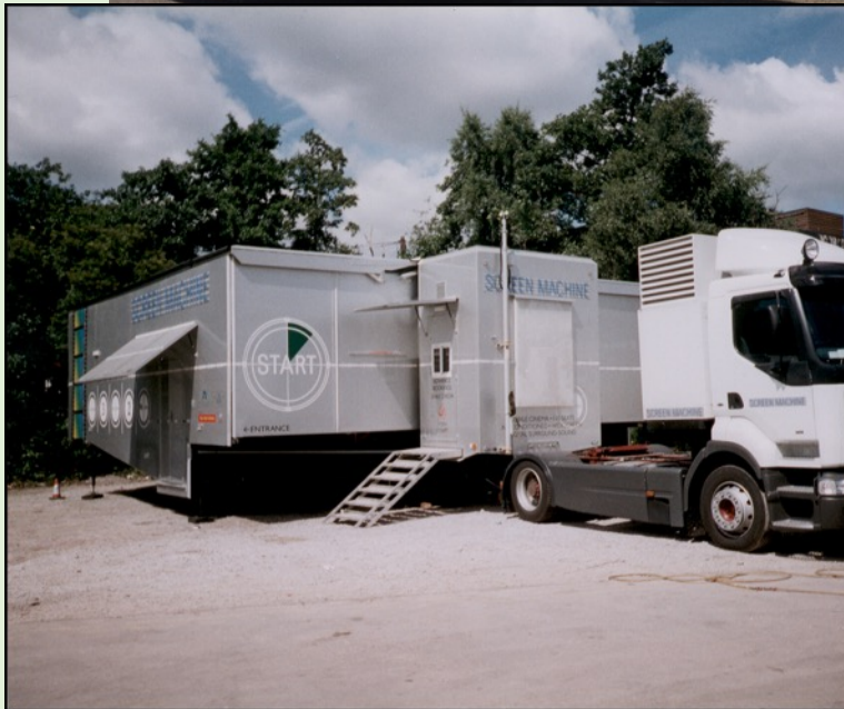
Screen Machine 1